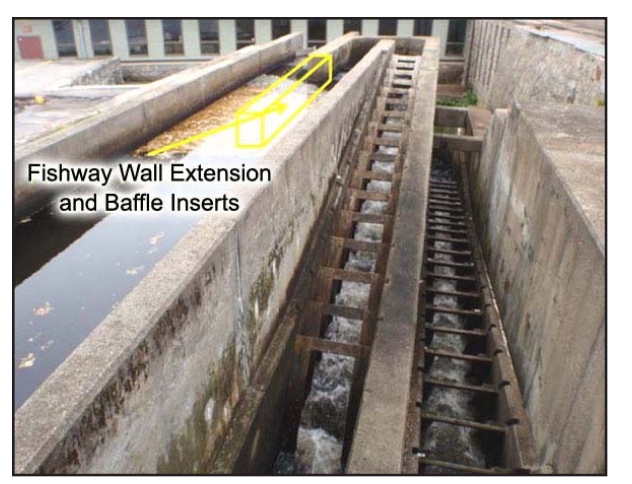
The Palisades Mill Fish Ladder to include an extension and new baffle system. See yellow in photo.

The Nature Conservancy is working closely with RIDEM F&W to schedule these modifications for improving the fish ladders during the fall of 2018.