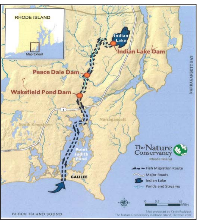
The Saugatucket River runs from Indian Lake to the north to the northern end of Point Judith Pond and empties into Block Island Sound.

Most recent observions and assessments by RIDEM, NOAAA and USFWS fish passage engineers have identified several problems, as well as opportunities to improve, fish passage performance at both the Palisades Mill and Indian Lake fish ladders.